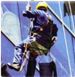
Harness and safety systems