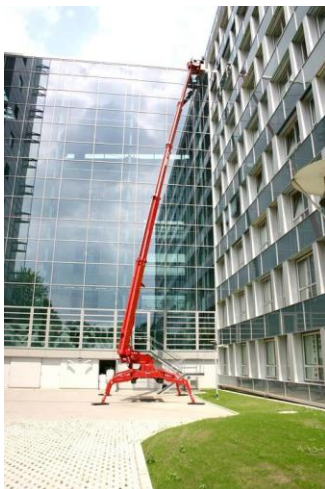
Access with cherry picker