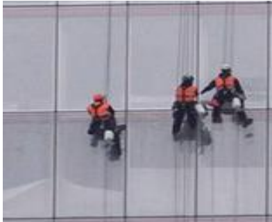
Spider cleaning method