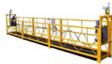
7.5m Temporary suspended platform.