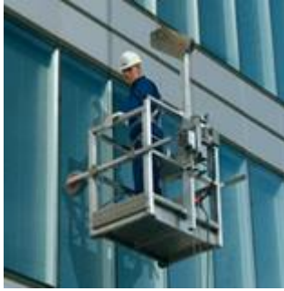
Cleaning with 1.25 m cradle