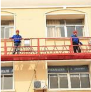
Platforms under operations