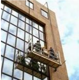
Cleaning with 2 m cradle